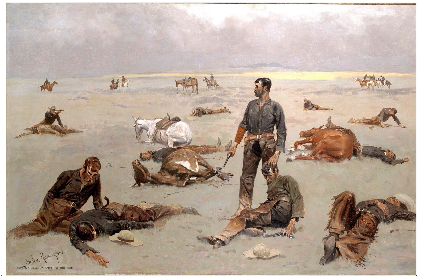
What An Unbranded Cow Has Cost by Frederic Remington Depicts the aftermath of a range war between cowboys and supposed rustlers. 1895

Old West range wars have been the subject of many movies and novels. Some examples are: