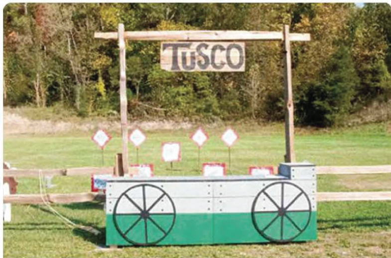
Stage 5 features our Tusco sign

overdue, well-deserved recipient. Moosetracks—This year at Tusco we had many new and exciting stage props with which to play. This was due to the hard work Moosetracks put in. We now have new stage props for all five of our shooting bays thanks to Moosetracks. Last but not least, Rye Miles—Running a posse is not an