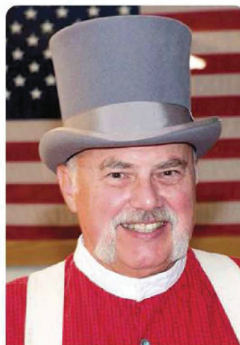
Catlow, SASS #4697, donned a very stylish top hat for the banquet.

walked away with three prizes each. Some of the prizes were donated by our various sponsors and supporting Cowboy Action Shooting™ clubs.