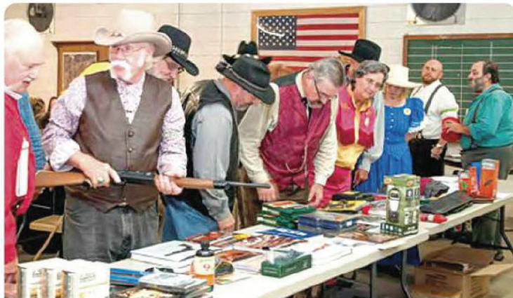
Our Saturday night banquet included our BIG prize table. Most everyone took THREE prizes home!

catered our dinner, which consisted of BBQ pulled pork sandwiches, BBQ chicken, green beans, cheesy potatoes, and a salad. Six Gun Seamus provided us with a video showing some of our Cowboys and Cowgirls in action. The BIG prize table was back again this year with well over two hundred prizes on it. All registered shooters in attendance