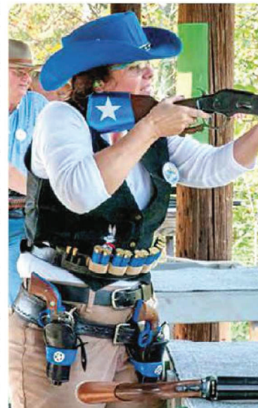
Blue Hare loves to wear blue throughout her shooting costumes - even her shotgun shells are blue!

With that, High Noon at Tusco 2013 came to a close. I hope every-