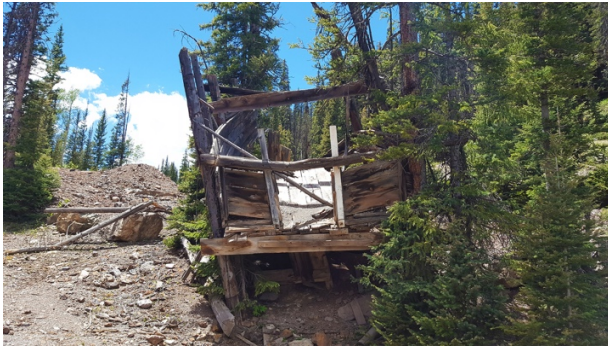
Remains of an abandoned mine's ore bin along the Million Dollar Highway between Durango & Silverton