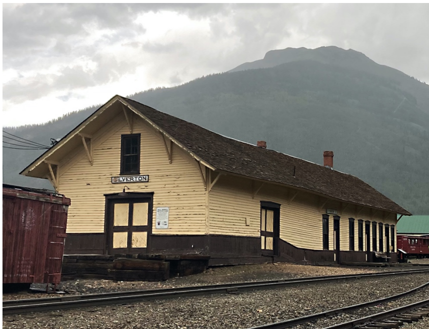
Silverton-Train-Depot, Silverton, Colorado

Now the Durango and Silverton Narrow Gauge Museum