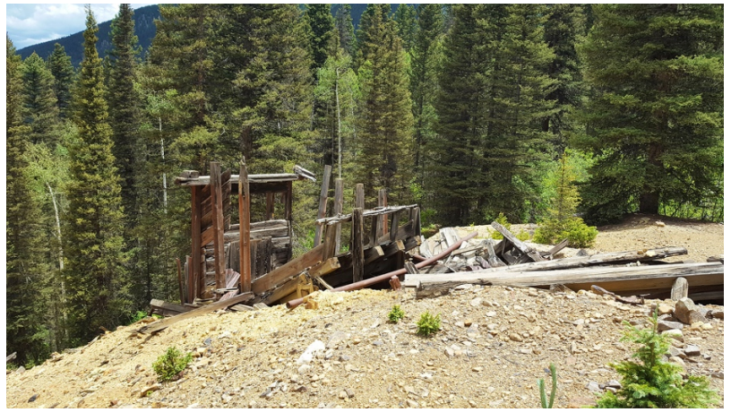
An abandoned mine just above Silverton